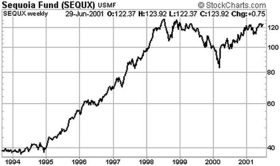
FIGURE 21.1 Sequoia Fund's Performance, 1994–2001.

Ruane's office is in the General Motors/Trump Building—on 59th Street and Fifth Avenue—with green marble and white marble in the lobby. Across the street from the Plaza, à la Vieille Russe, FAO Schwarz, Bergdorf Goodman. Ruane's 47th-floor office—simple and classic, much dark wood, no Quotron machine, no Bloomberg—has a gorgeous view of Central Park and parts north. Tasteful, conservative, interesting furniture. On an end table is Roger Lowenstein's biography of Warren Buffett. (It called Ruane "a straight arrow.") In a bookcase: James Kilpatrick's biography of Buffett, along with many investment books, stuff about Harvard, photos of family, books by Adam Smith, a biography of Bernard Baruch.