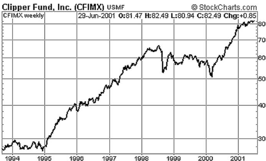
FIGURE 29.1 Clipper Fund's Performance, 1994–2001.