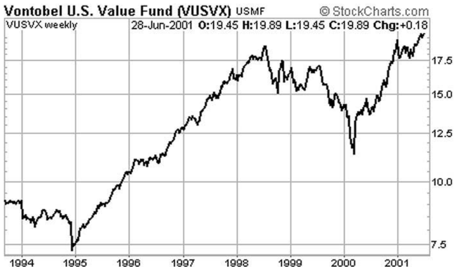
FIGURE 28.1 Vontobel U.S. Value Fund's Performance, 1994–2001.

Even without momentum investors ready to skip without a moment's notice, running a value fund would be no picnic. Today, there are hardly any good companies out there that you can scoop up for a song. "It's a limited universe," Walczak said grumpily. "The potential is very, very narrow. There may be 150 companies good enough for us to buy. There used to be only 50 or 60, but now I'll even consider Intel and Microsoft and Ford—though I haven't pulled the trigger on any of them yet. Not even at their lows. They're not predictable enough."